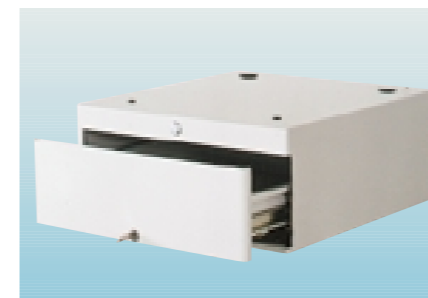
Front-loading safe-deposit boxes Type 1403