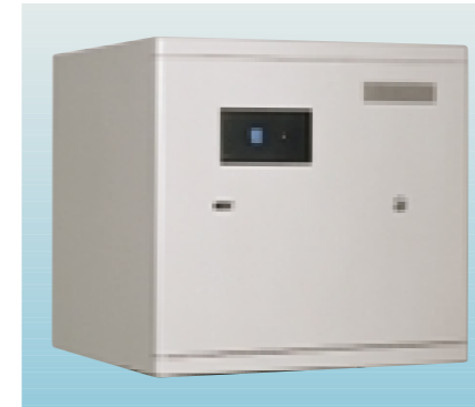
Deposit safe Type 1401